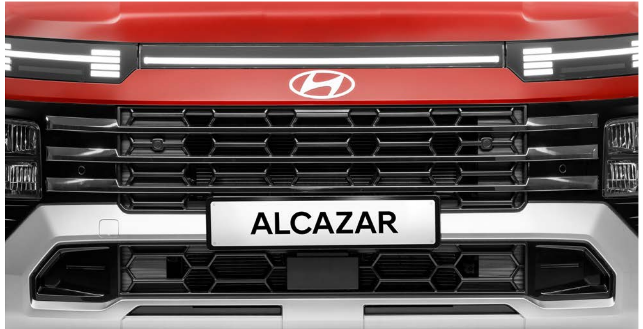
Radiator grille chrome coating*