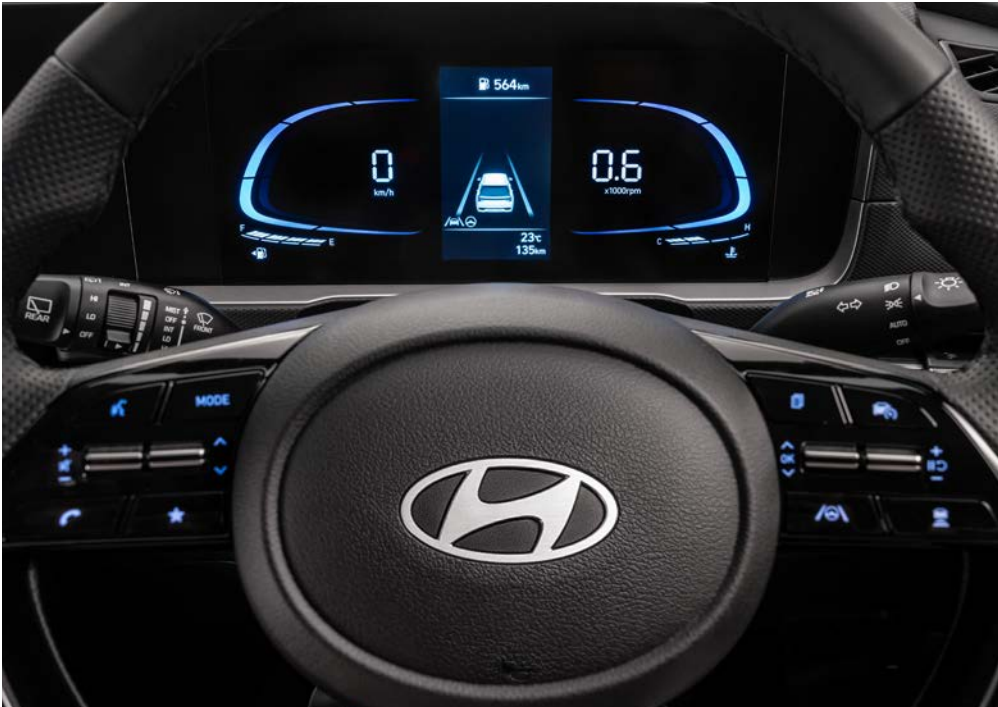
Cluster & smart cruise control*