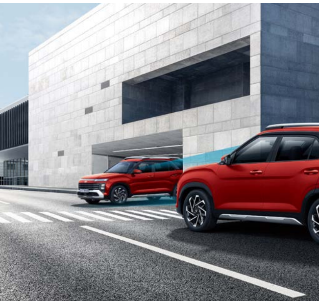
Forward collision avoidance assist (FCA)*