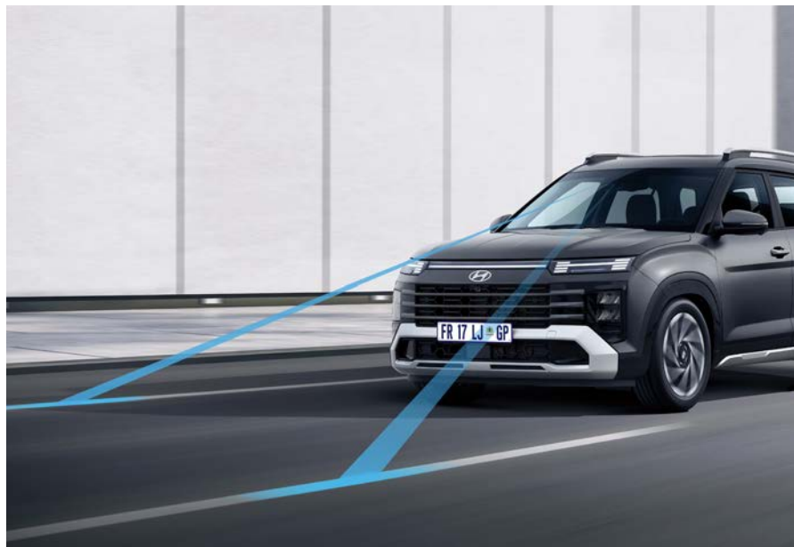
Lane follow assist (LFA)*