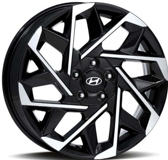
18" alloy wheels*