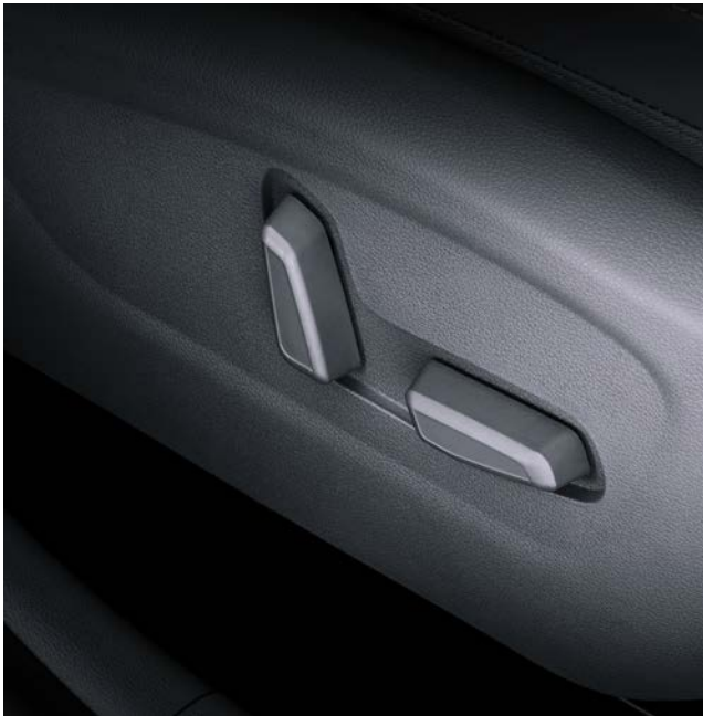
Electric driver seat adjustment*