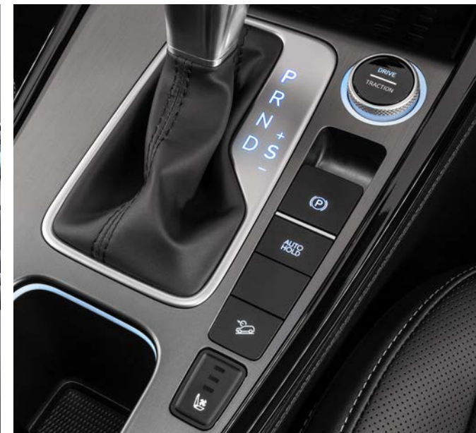
Electric parking brake with autohold