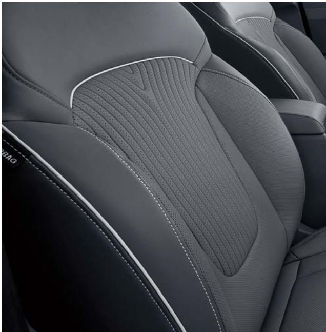
Artificial leather seats