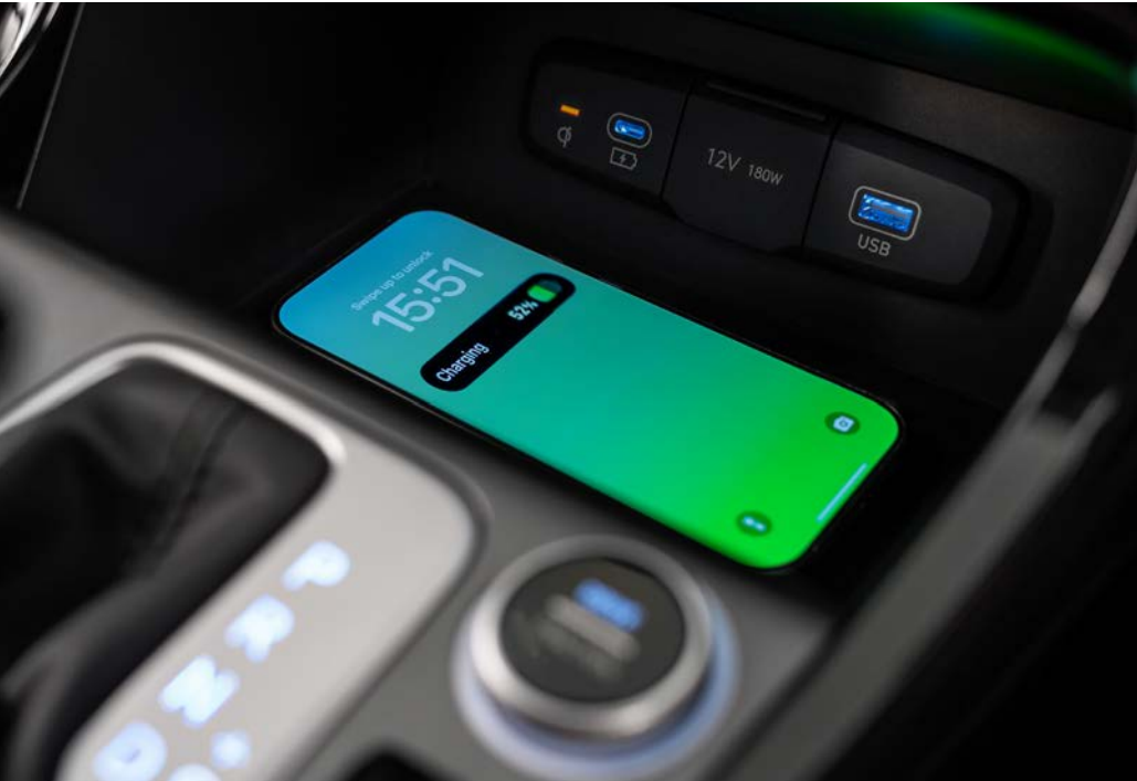
Wireless phone charging